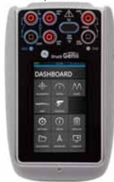
DPI 620G Multifunction Calibrator and Communicator