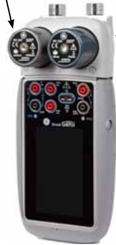
Measure and source mA, mV, V, ohms, frequency, RTD's and thermocouples.