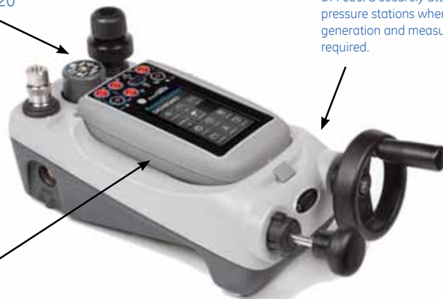
Re-rangeable pressure measurement and generation from 25 mbar (10 inH 2 O) to 1000 bar (15000 psi)